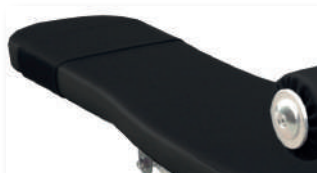
70mm Thick Pads