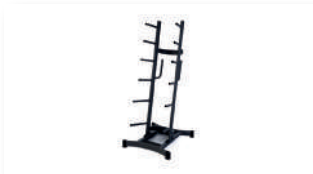
12 Set Rack