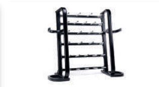
30 Set Rack