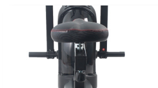
Foot Pegs for Upper Body Workout